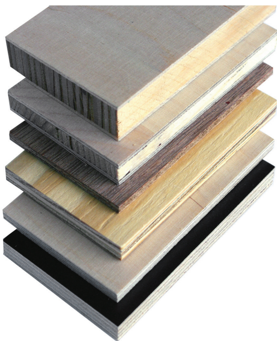
Figure A2.4 Various types of plywood

The term 'plywood' includes both the true 'veneer plywood' and also 'core plywood' of which 'blockboard' and 'laminboard' are examples. Typical examples of these products are shown in Figure A2.4 .